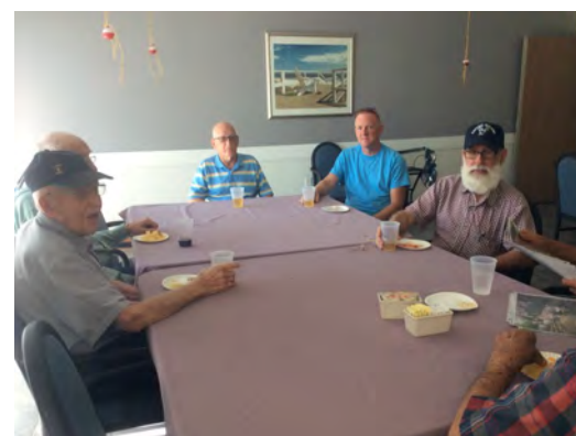
Father's Day Grillin' & Chillin' at The Lakeside Village

We will provide more detailed handouts to all of the residents on oral health care.